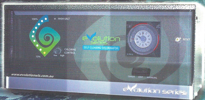
evolution Series Chlorinator